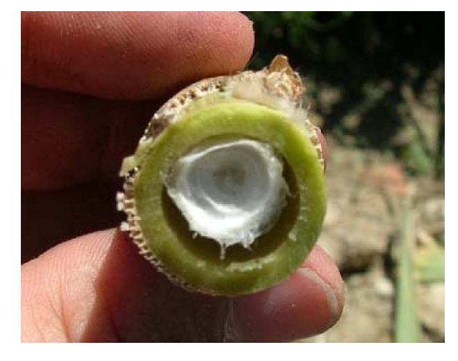
Fig. 3. The white hemicellulose membrane found at the node of the giant reed ( Arundo donax L. [Poaceae]) is used as a haemostatic agent for minor lacerations.

Small tooth-sized pieces of the reed are also cut up and used in the ritual treatment of toothache (Quave and Pieroni, 2005). Antiproliferative activity against several human cancer cell lines has been reported for a lectin isolated from the rhizomes of this plant (Kaur