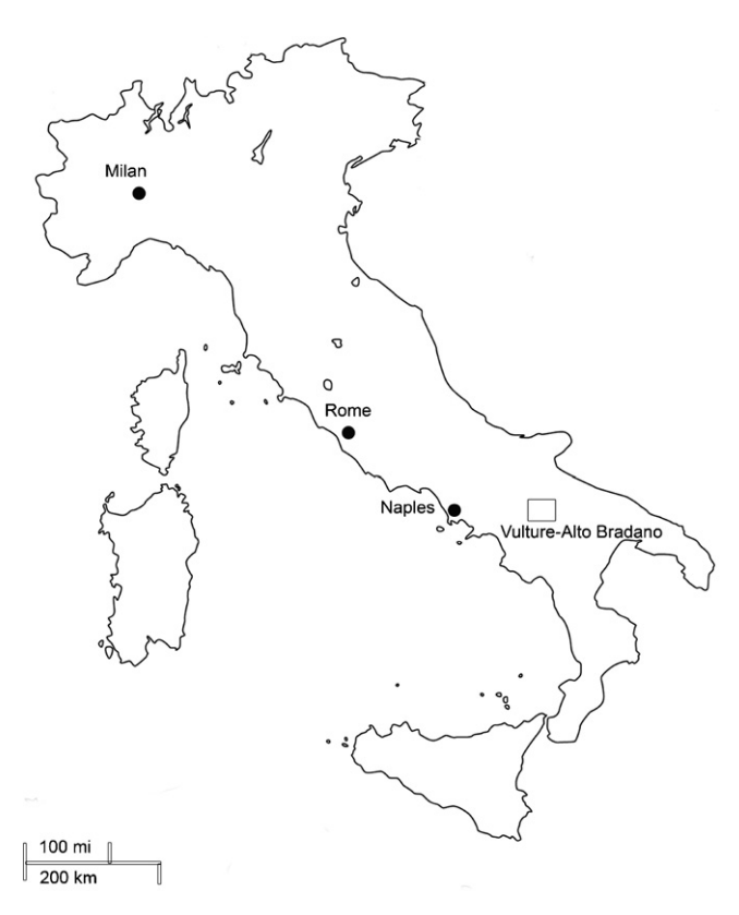
Fig. 1. Map of the study area: Vulture-Alto Bradano, Basilicata Province, Italy.

food and medicine, making up an integral facet of home healthcare (Pieroni et al., 2002b,c; Pieroni and Quave, 2005; Quave et al., 2008). At least one-third of all medicinal plants utilized in the folkpharmacopoeia of this area are applied towards the treatment of skin and soft tissue infection (SSTI) (Quave et al., 2008). Vulture-Alto Bradano is characterized by small scale agriculture and its inhabitants maintain strong ties with the land. The demographic and socioeconomic aspects of this area are described in previous works (Pieroni et al., 2002c; Quave and Pieroni, 2005; Quave et al., 2008).