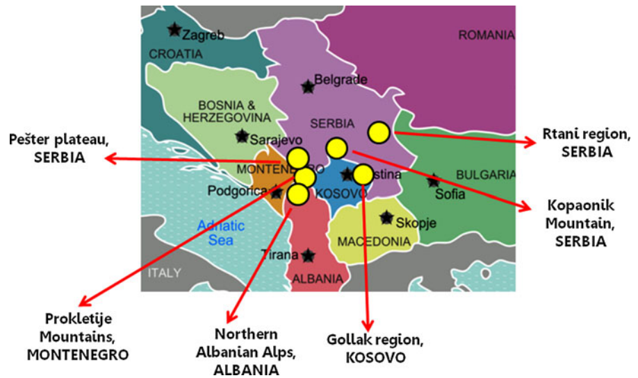
Table 2 Comparison between the wild medicinal plant uses recorded in Gollak and those recorded in previously conducted ethnobotanical field studies in surrounding Western Balkan regions