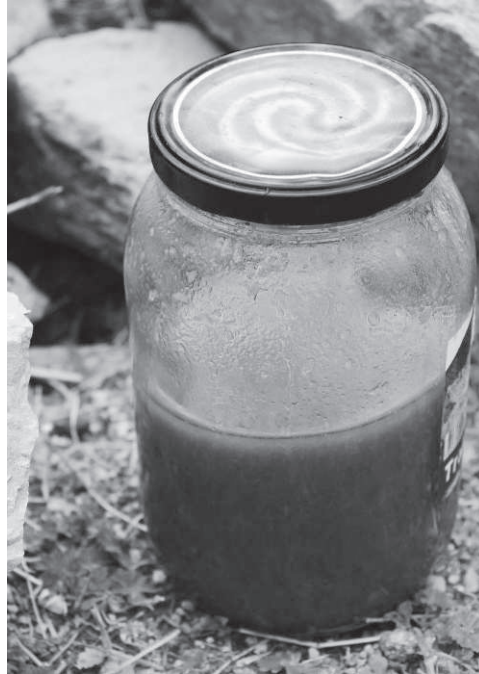
Figure 3. The fruits of Prunus spinosa L. are crushed, mixed with water, sealed in a large jar as depicted (ca. 30 cm wide, 60 cm tall) and left to ferment, eventually forming a gassy fruit soda that is filtered and drunk as a source of refreshment and for its general health boosting properties. Following the fermentation, the fruit soda is then strained and the liquid is typically transferred to empty 1 L plastic bottles (i.e., used Coca-Cola bottles) for storage and daily use.

of which are consumed for their refreshing quality and perceived health benefit (Figure 3). These beverages are created in an anaerobic environment (using sealed bottles) and sugar is sometimes added during the fermentation process to feed the culture and increase gas production (in the form of CO 2 ). The health benefits of these beverages are multifold, and the ease of preparation makes them a common household staple as a source of nutritious, potable beverages. Moreover, these non-alcoholic beverages are culturally appropriate for the Gorani as the use of alcoholic beverages is not permissible in the Islamic faith.